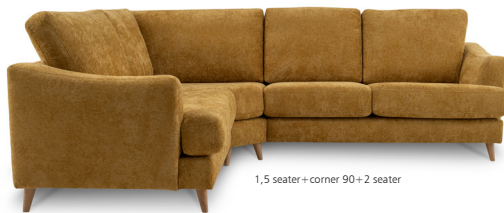
1,5 seater + corner 90 + 2 seater

2 seater with one arm (L) Art. No.: 18840 H92 x D102 x W154cm 2 seater with one arm (R) Art. No.: 18841 H92 x D102 x W154cm 2,5 seater Art. No.: 18890 H92 x D102 x W201cm 2,5 seater with one arm (L) Art. No.: 18891 H92 x D102 x W180cm 2,5 seater without arms (R) Art. No.: 18892 H92 x D102 x W180cm 3 seater Art. No.: 18893 H92 x D102 x W225cm Corner 90 Art. No.: 18842 H92 x D119 x W119cm