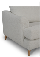
Arm - 21cm

3 seater with one arm (L) Art. No.: 18894 H92 x D102 x W204cm 3 seater with one arm (R) Art. No.: 18895 H92 x D102 x W204cm Chaiselongue part (L) Art. No.: 18898 H92 x D150 x W103cm Chaiselongue part (R) Art. No.: 18899 H92 x D150 x W103cm Open end part (L) Art. No.: 18896 H92 x D102 x W127cm Open end part (R) Art. No.: 18897 H92 x D102 x W127cm Footstool Art. No.: 18901 H50 x D60 x W80cm